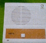
HBT-A Sub station