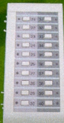
HBT-20G 20-call Extension