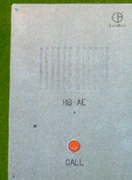
HB-AE Tamper-proof stainless steel sub