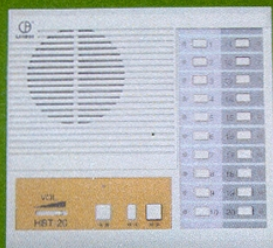
HBT-20 20-call Master

Intermixable, reliable and expandable HBT-10, HBT-20, HBT-20G, HBT-40, HBT-60, up to HBT-180 HBT-A, HB-AE, HBT-C, HBT-M, AN