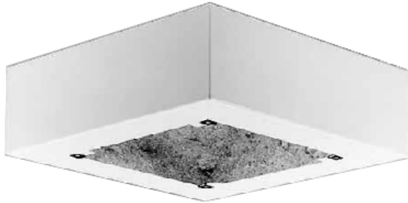
CB84 Surface Back Box