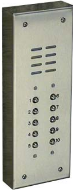
VI642S10 (10 Button) Surface Panel (Shown)