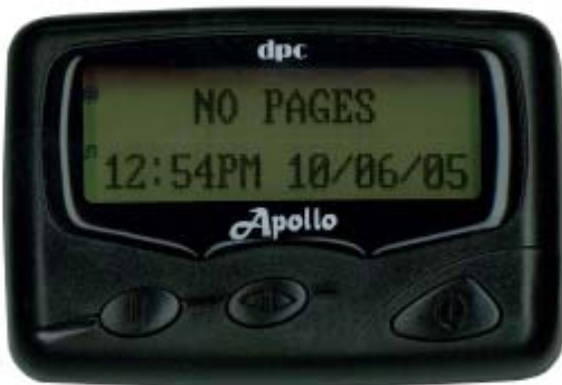
Alphanumeric Pocket Pager #PGR-AL924