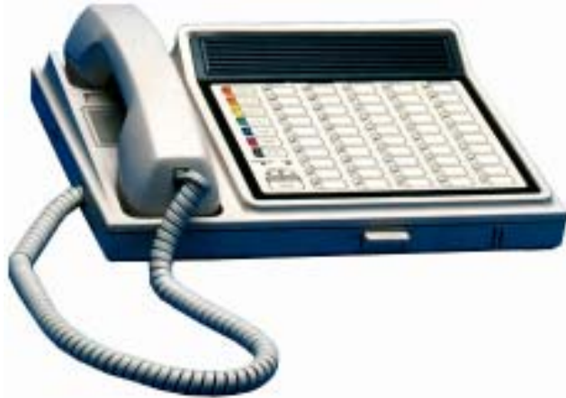
NC250 50 Station Master