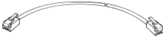
Typical STRAIGHT Cord