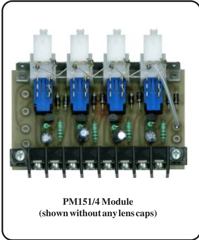
PM151/4 Module (shown without any lens caps)