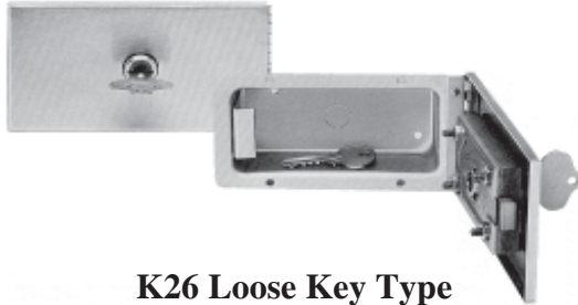
K26 Loose Key Type