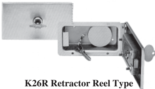
K26R Retractor Reel Type