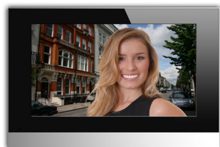
AT700MSE Video Intercom Monitor 7.0" Touchscreen (Diagonal)