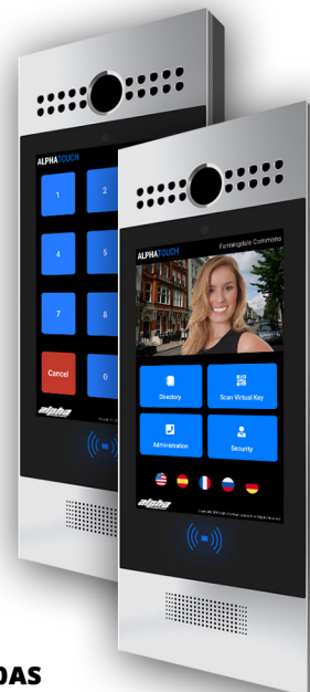
AT700AS Door / Entry Panel 7.0" Touchscreen (Diagonal) with 120° Camera