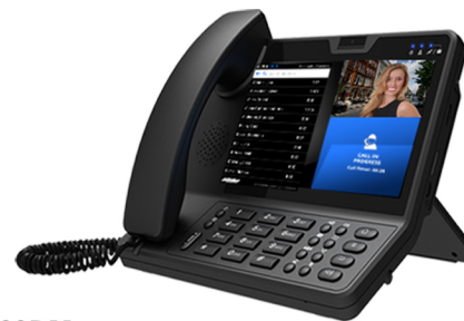
AT700DM Staff / Concierge Station 7.0" Touchscreen (Diagonal) with Privacy Handset