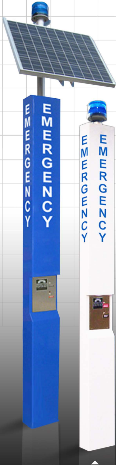
Standard White with Blue Emergency Wording